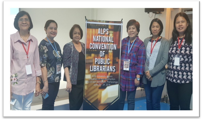
OCPL participants with Hon. Lourdes T. David, Chair of the CPD Council.

This convention was different from other conventions conducted in the past. The organizers ensured to incorporate workshops at the end of each lecture, wherein everybody participated in the formulation of groups' proposals and innovations which could be replicated or implemented in their respective libraries.