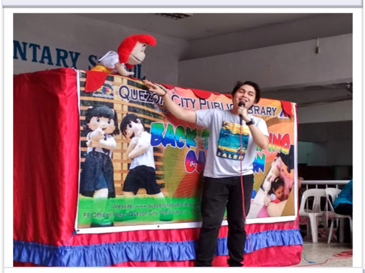
Puppet Chuchay and Kuya Reigel during the puppet show.