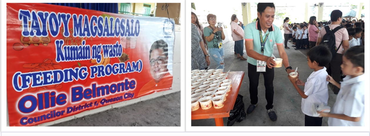
Distribution of foods during the feeding program on Nutrition Month Campaign

July is National Nutrition Month, pursuant to Presidential Decree No. 491.